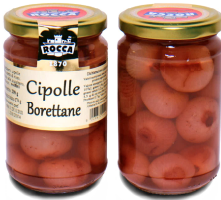
COD.B106 Spiced onions in vinegar