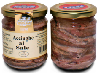
COD.T905 Anchovies in brine