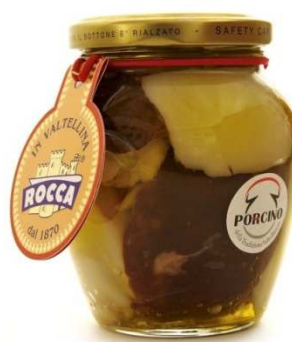
COD.A021 Cut porcini mushrooms in olive oil