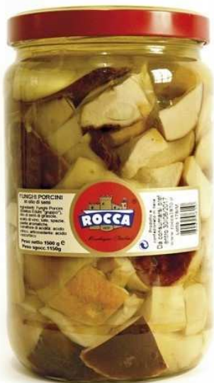
COD.H365 Cut black porcini mushrooms in olive oil