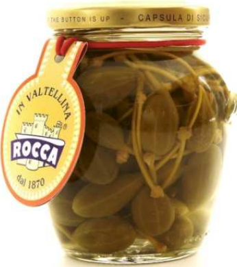
COD.A018 Caper fruits in vinegar

Cylindrical and Tusco Jar cc 314 – 12 pieces for pack/film