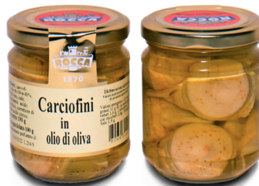
COD.T903 Artichokes hearts medium size in olive oil

Papalina Jar cc 280 – 12 pieces for pack/film