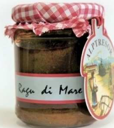
COD.T939 Seafood meat sauce