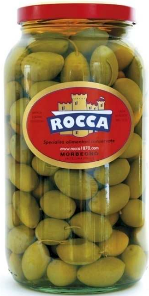
COD.J414 Giant green olives in brine