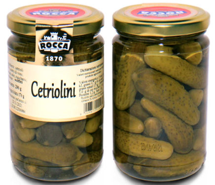
COD.B104 Finest pickled green gherkins in vinegar