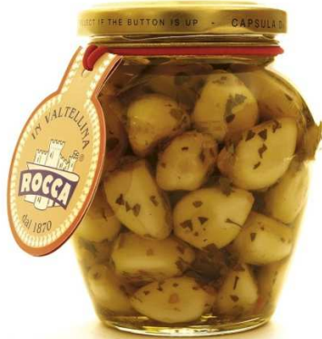
COD.A017 Sweet aromatized garlic in extra virgin olive oil