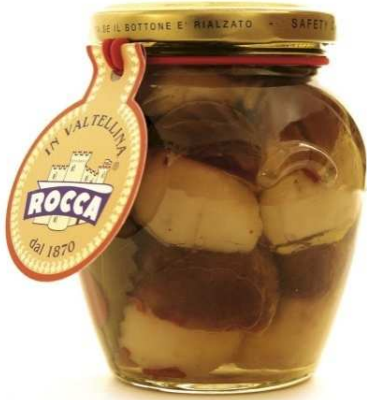
COD.F283 Whole black porcini mushrooms in olive oil