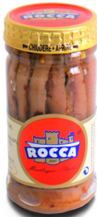
COD.V005 Flat fillets of anchovies w/small peppers in olive oil