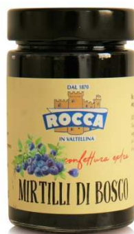
COD.X012 Blueberry Jam