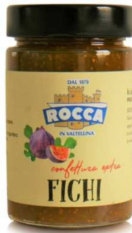
COD.X003 Figs' Jam