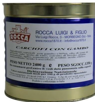
COD.R777 Roman artichokes in sunflower oil