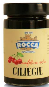
COD.X010 Cherries' Jam