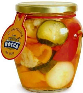
COD.A012 Artisanal Mixed vegetables in sweet and sour