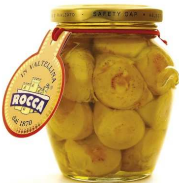
COD.A016 Artichokes hearts size "00" in olive oil

Tusco and Cylindrical Jar cc 314 – 12 pieces for pack/film