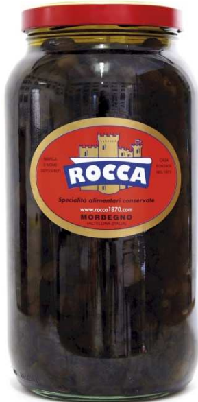
COD.J416 Black olives boneless in extra virgin olive oil