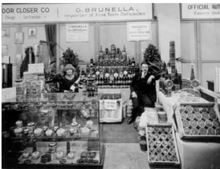
New York year '20s