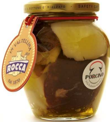
COD.F285 Cut porcini mushrooms in olive oil