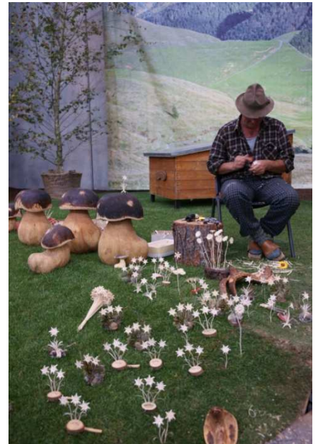
Artist in the valley