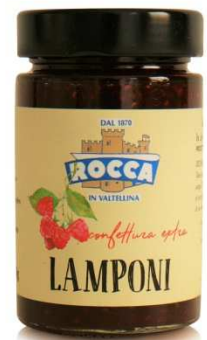
COD.X011 Raspberry Jam