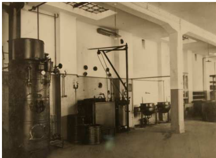
The factory in the '20s...