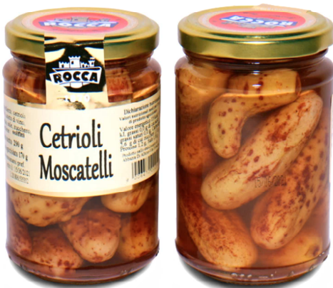
COD.B105 Moscatelli gherkins in vinegar