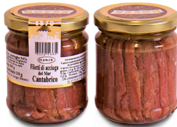
COD.T919 Flat fillets of anchovies ex.large "Cantabrico" in olive oil