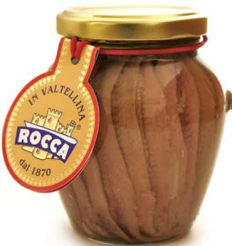
COD.A010 Flat fillets of anchovies ex.large "Cantabrico" in olive oil