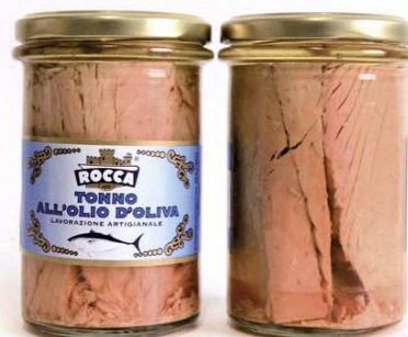
COD.M562 Fillets of tunny "Yellowfin" in olive oil