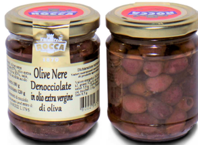
COD.T914 Black olives boneless in extra virgin olive oil

Cylindrical and Tusco Jar cc 314 – 12 pieces for pack/film