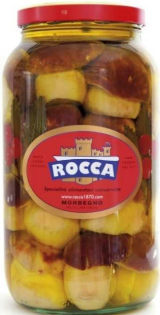
COD.J409 Whole black porcini mushrooms in olive oil