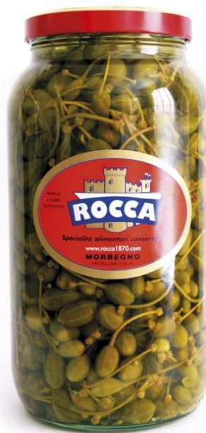
COD.J420 Caper fruits in vinegar