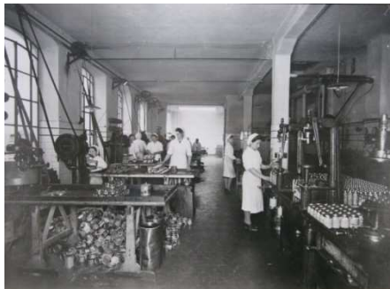
... and in the '30s