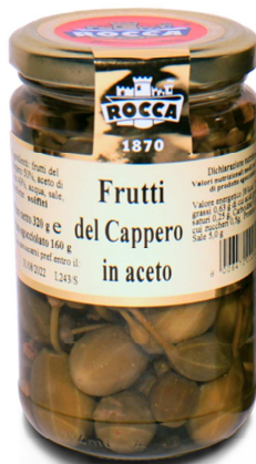
COD.B110 Caper fruits in vinegar