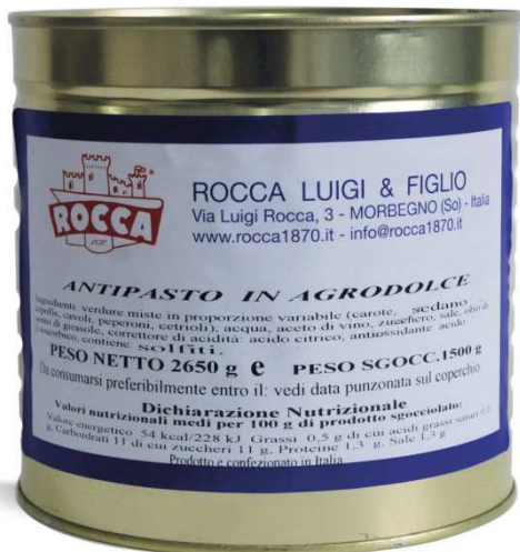
COD.R754 Vegetable antipasto in sweet and sour