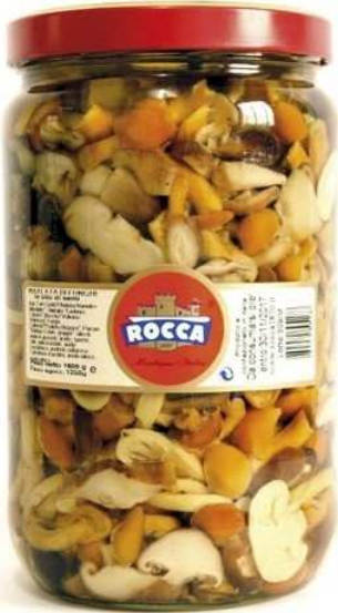
COD.H368 Mushrooms Fantasy w/porcini in sunflower oil