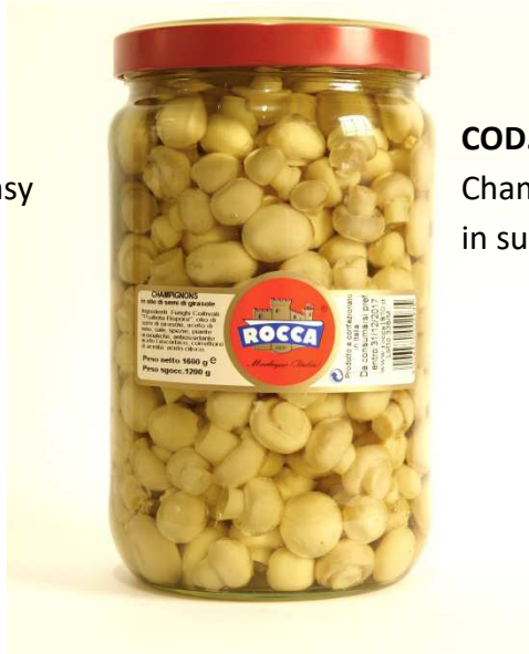
COD.H392 Champignons mushrooms in sunflower oil