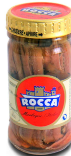
COD.V004 Flat fillets of anchovies in olive oil