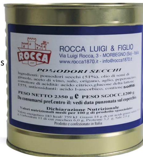
COD.R764 Dried seasoned tomatoes in sunflower oil