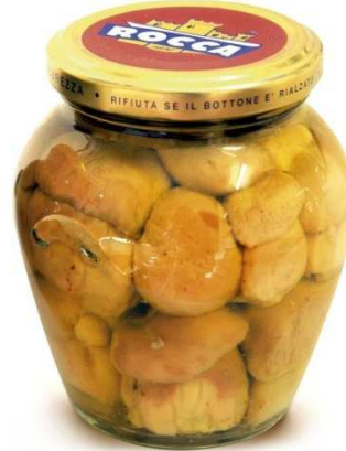
COD.F284 Whole porcini mushrooms in olive oil