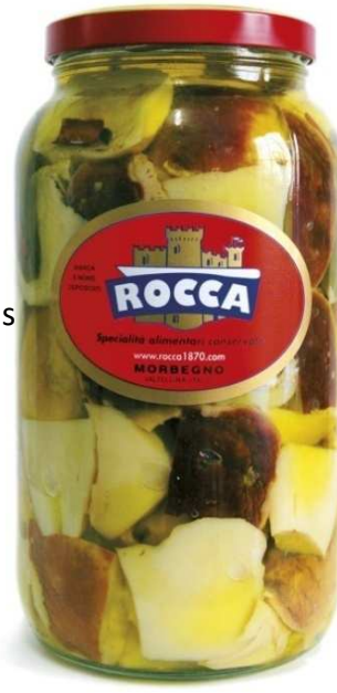
COD.J411 Cut porcini mushrooms in olive oil