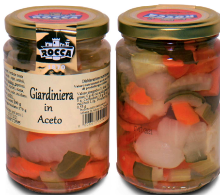
COD.B115 Finest pickled vegetables in vinegar