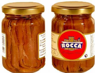
COD.M502 Flat fillets of anchovies in olive oil