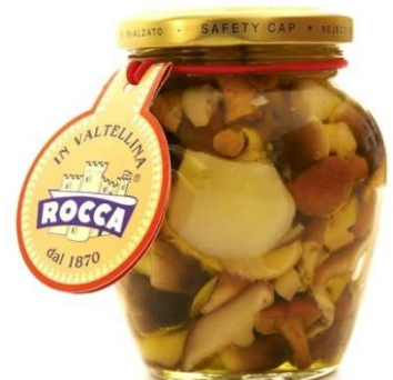
COD.A022 Mushrooms Fantasy w/porcini in olive oil