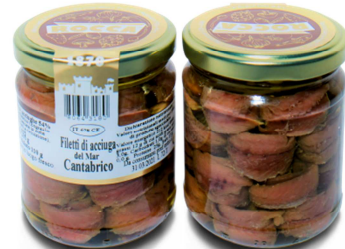
COD.T920 Rolled fillets of anchovies ex.large "Cantabrico" in olive oil