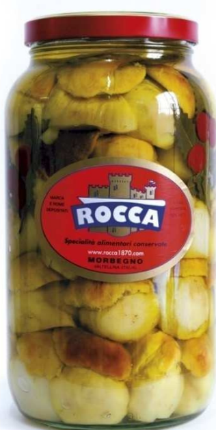
COD.J410 Whole porcini mushrooms in olive oil