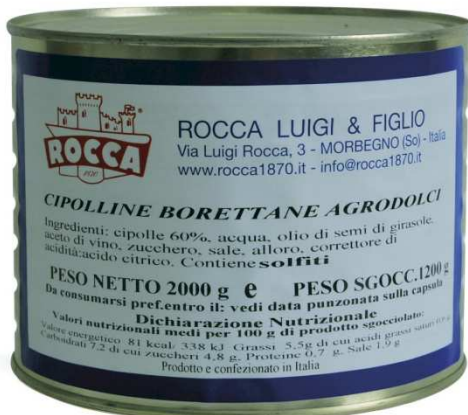
COD.R770 Borettane onions in sweet and sour