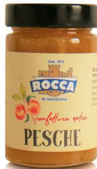
COD.X007 Peach Jam