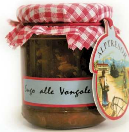
COD.T943 Clams sauce