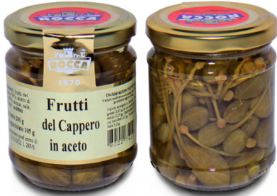
COD.T906 Caper fruits in vinegar

Cylindrical Jar cc 212- 12 pieces for pack/film