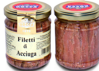
COD. T957 Flat fillets of anchovies Sicilian fishing in olive oil