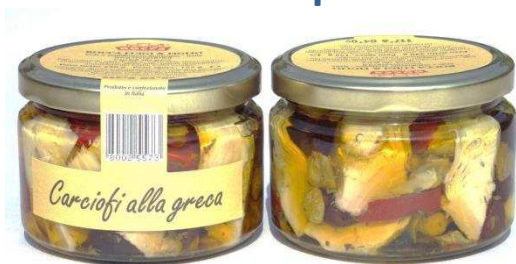
COD.Z010 Artichokes greek style in olive oil

Papalina Jar cc 280 – 12 pieces for pack/film