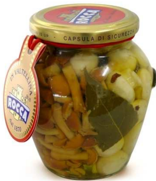
COD.A024 Assorted mushrooms in olive oil