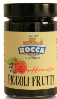
COD.X016 Small fruit Jam