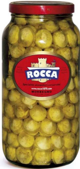
COD.J403 Artichokes hearts size "1" in olive oil