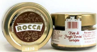
COD.S810 Porcini mushrooms w/truffle patés