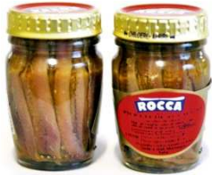
COD.M506 Flat fillets of anchovies in olive oil