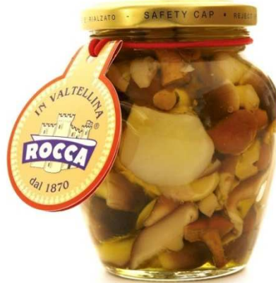
COD.F286 Mushrooms Fantasy w/porcini in olive oil