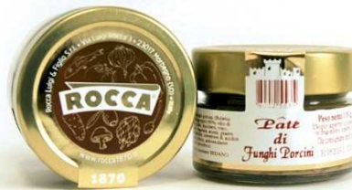
COD.S808 Wood porcini mushrooms patés