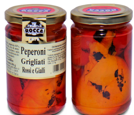
COD.B124 Grilled peppers in vinegar