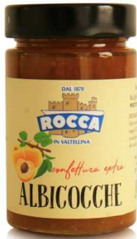
COD.X001 Apricot Jam

Cylindrical Jar cc 212 – 6 pieces for pack/film