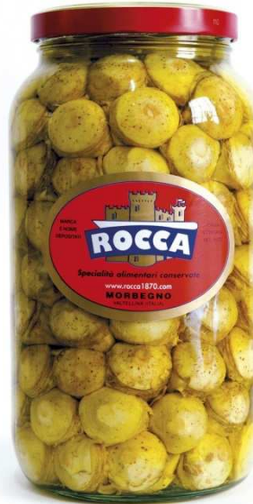
COD.J404 Artichokes hearts size "2" in olive oil