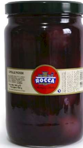
COD.H391 Red oval onions in red wine vinegar