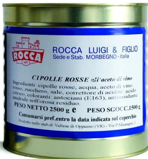
COD.R761 Red oval onions in sweet and sour