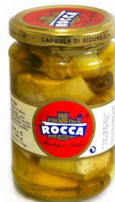
COD.B102 Artichokes hearts in extra virgin olive oil