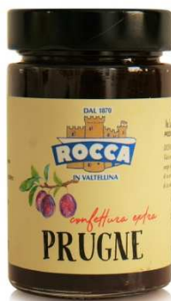
COD.X009 Plum Jam