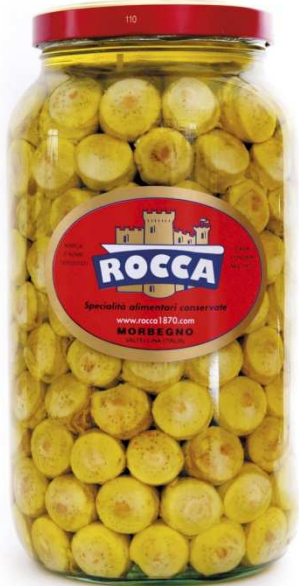
COD.J402 Artichokes hearts size "0" in olive oil