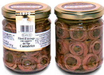
COD.T920B Rolled fillets of anchovies w/capers "Cantabrico" in olive oil