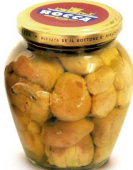
COD.A020 Whole porcini mushrooms in olive oil