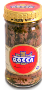
COD.V006 Flat fillets of anchovies w/parsley in olive oil