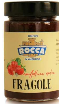
COD.X004 Strawberry Jam