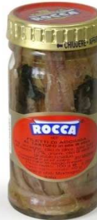
COD.V011 Flat fillets of anchovies w/ truffle in olive oil