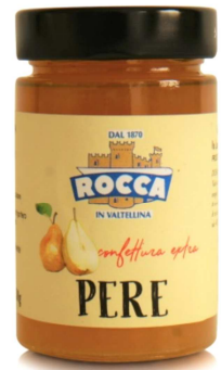
COD.X006 Pear Jam