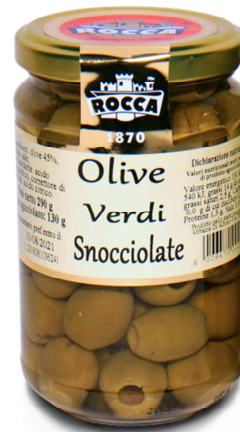
COD.B128 Green olives boneless in brine