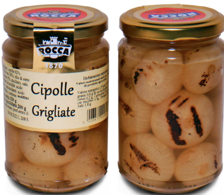
COD.B108 Grilled onions arom. in vinegar