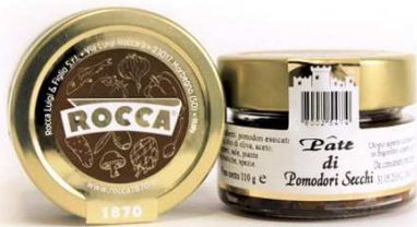
COD.S805 Sundried tomatoes w/Mediterr.fragrance patés