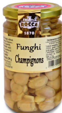
COD.B112 Champignons mushrooms in sunflower oil