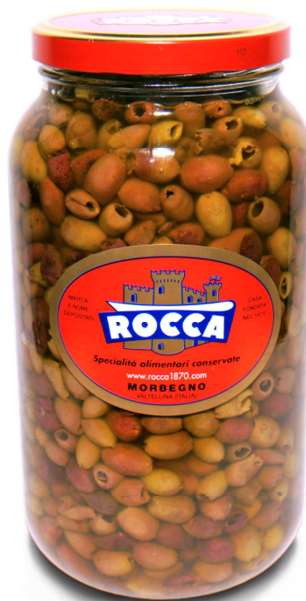
COD.J427 Black Taggiasca olives boneless in extra virgin olive oil