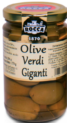
COD.B121 Giant green olives in brine