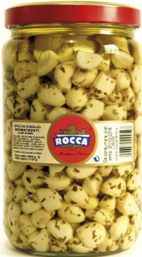
COD.H383 Sweet aromatized garlic in sunflower oil