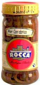
COD.V001 Flat fillets of anchovies ex.large "Cantabrico" in olive oil