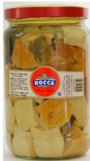
COD.H366 Cut porcini mushrooms in sunflower oil