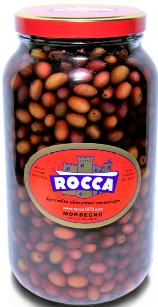
COD.J426 Whole Taggiasca olives in brine