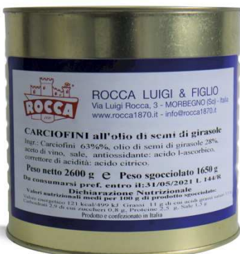
COD.R752 Artichokes 50/60 (T.2) in sunflower oil