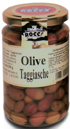
COD.B120 Whole Taggiasca olives in brine