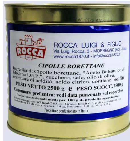
COD.R756 Borettane onions in balsamic vinegar