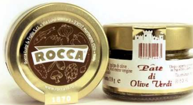
COD.S802 Green olives patés