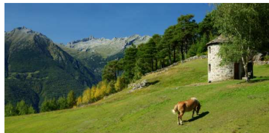
...our mountains: the Retic Alps!