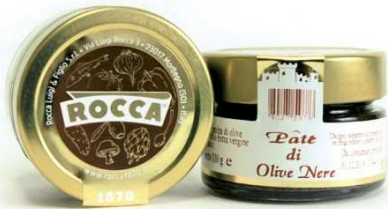
COD.S801 Black olives patés

Papalina Jar cc 106 – 12 pieces for pack/film