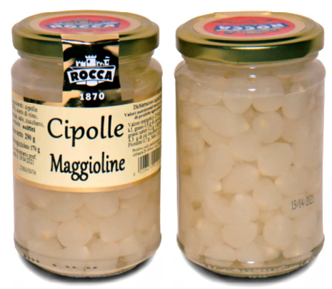
COD.B107 Maggioline onions in vinegar