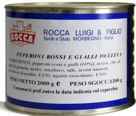
COD.R771 R/Y peppers in sweet and sour