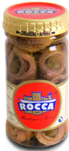
COD.V002 Rolled fillets of anchovies w/capers in olive oil