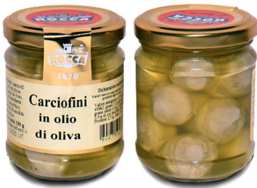
COD.T902 Artichokes hearts small size in olive oil

Cylindrical Jar cc 212 – 12 pieces for pack/film