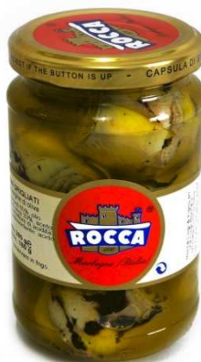
COD.B101 Grilled artichokes in extra virgin olive oil