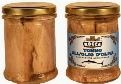
COD.M560 Fillets of tunny "Yellowfin" in olive oil